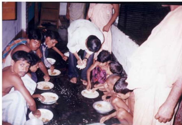
Muslims are also taking food of Pranabananda math of Bajitpur everyday (Photo. 2/8/2002)